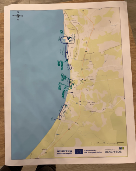
Image 3: Right: Poster with the results of one of the Local level working groups showcasing the tourism vision and barriers for Saulkrasti by 2050. Left: Mapping exercise with the results of one of the Local-level working groups showing iconic natural and people-made structures on the coast of Saulkrasti.