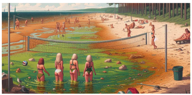
Image 7: Envisioning the Future Beach: Student Dreams Meet Climate Change. Examples include imaginary but plausible scenarios of wet summers, drought, coastal erosion and eutrophication due to climate change (Ai-Generated images).